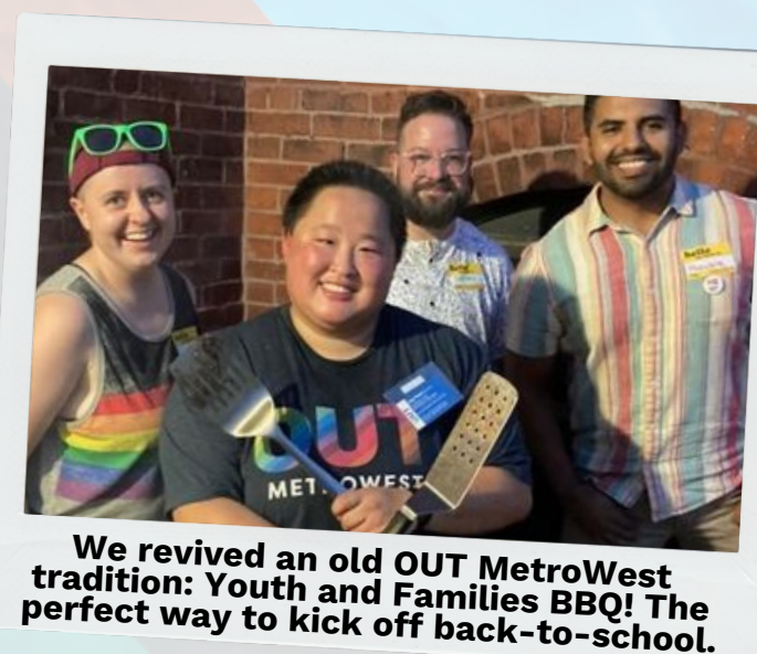
We revived an old OUT MetroWest tradition: Youth and Families BBQ! The perfect way to kick off back-to-school.

Nova, our new program for LGBTQ+ young adults ages 19-29, launched in fall 2022. 50+ participants enjoyed monthly gatherings including archery, dinners at LGBTQ+-owned local restaurants, art nights, and more!