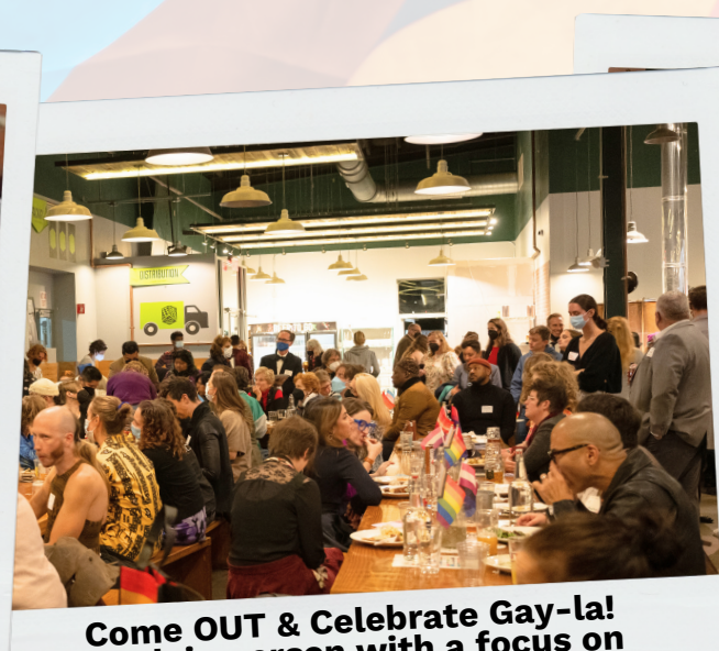
Come OUT & Celebrate Gay-la! Back in person with a focus on community and accessibility.