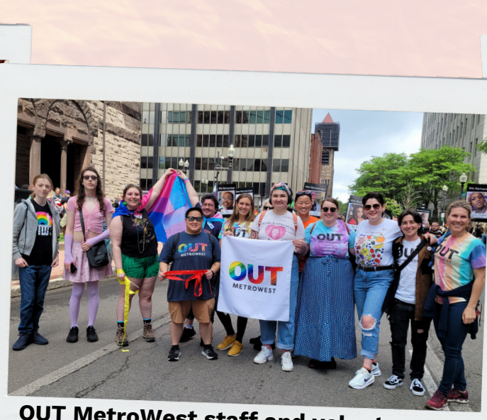
OUT MetroWest staff and volunteers at Boston Pride for the People. One of 20+ Pride events we attended this year!